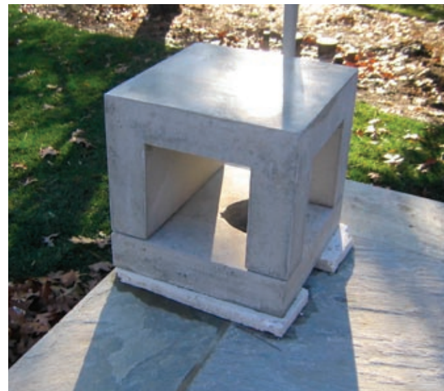
Silvermine Workshop, Wilton, CT

The speaker boxes have 4-inch thick walls, with a cavity opening underneath the top of the boxes that houses PVC tubing for the speakers and wiring. Lights were installed in the base of the boxes. Because of the solidity of the concrete and the construction, there is no vibration of the sound within the boxes. The crystal clear sound projects into any area it faces.