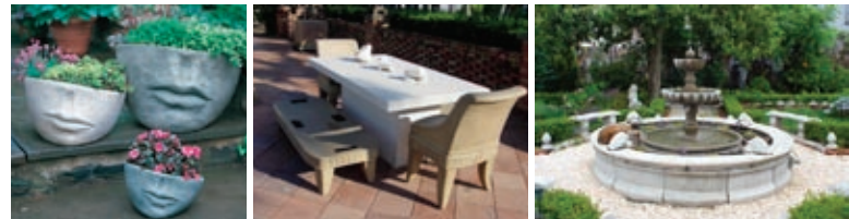
From left to right: Campania International; Concrete-N-Counters, Lutz, FL; Secret Garden Statuary, Seattle, WA

Cast stone can be made from white or gray cement, and often mineral pigments or decorative aggregates are tossed into the mix to add color and variation. Because the pieces are cast in molds under controlled manufacturing and curing conditions, they are more consistent in appearance and more predictable in performance than natural stone. Plus, they can be reinforced with steel or with glass or plastic fibers to improve strength and inhibit cracking.